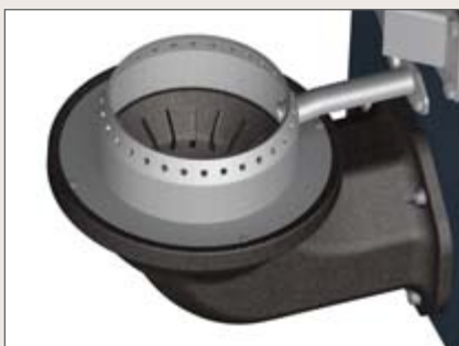
High quality cast iron burning pot with electronic ignition.